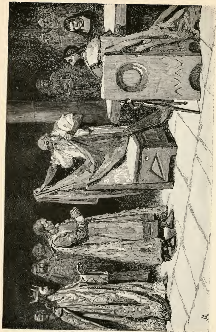
Sir Galahad brought to the Siege Perilous.